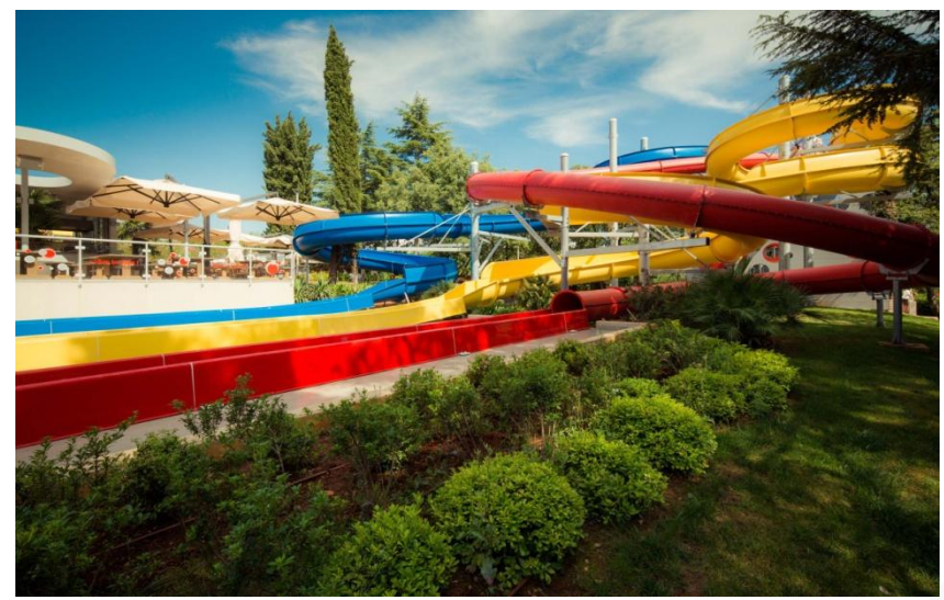
Location Situated 3 km from the centre of Umag, in the Katoro Resort.