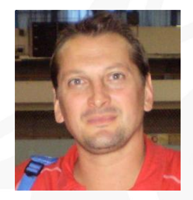
Predrag Stojadinov World and European Champion, National Serbian Coach

Uniline d.o.o. \cdot S. Dobricha 16 \cdot HR-52100 Pula \cdot Croatia Tel: +385 52 390 000 · Fax: +385 52 215 036 · uniline@uniline.hr · www.uniline.hr Temeljni kapital: 2.621.000,00 kn · Članovi uprave: B.Žgomba i S.Salković MB: 1228102 · OIB: 74786390334 · ID: HR-AB-52-040048499 · Žiro račun: 2484008-1100646084