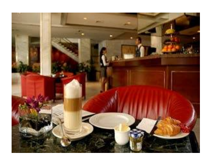
Intermezzo Lobby Bar and Terrace

World class restaurants and bars of authentic cuisine and impeccable service