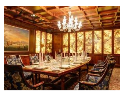
Captain Cook Restaurant

Coffee, tea, snacks, drinks, class choice of cigars