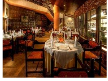
Lozenets Bulgarian Restaurant

Sushi fantasies in the heart of the Japanese garden