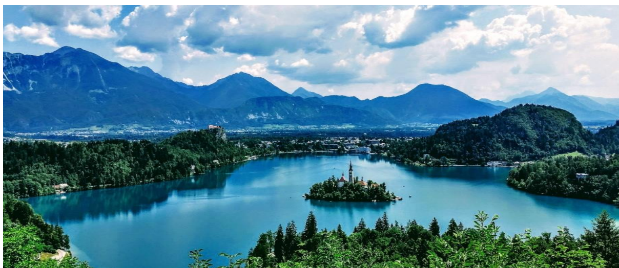
*Lake Bled, Slovenia

Slovenia has historically been the crossroads of Slavic, Germanic, and Romance languages and cultures. Although the population is not homogeneous, Slovenes comprise the majority. The South Slavic language Slovene is the official language throughout the country. Slovenia is a largely secularized country, but Catholicism and Lutheranism have significantly influenced its culture and identity. The economy of Slovenia is small, open and export-oriented and is thus strongly influenced by the conditions of its exporting partners' economies. It has been severely hurt by the Eurozone crisis which started in 2009. The main economic field is services, followed by industry and construction.