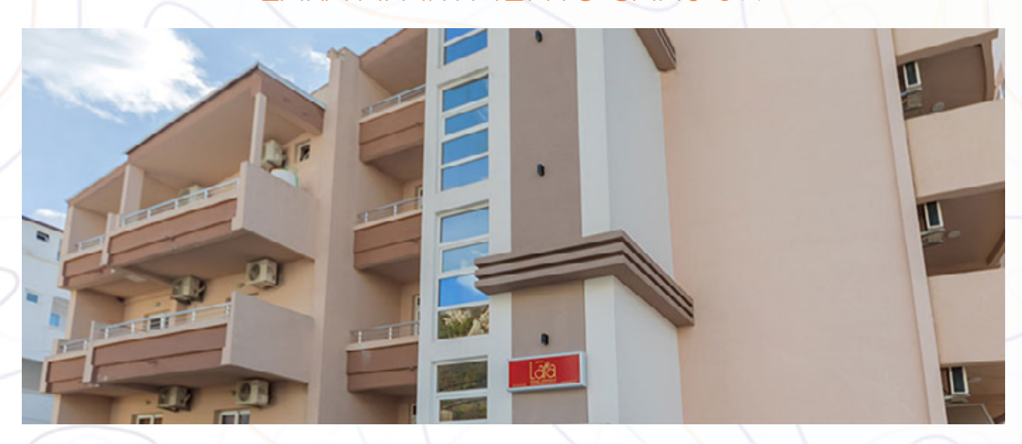
HOTEL SIDRO BAR 3★