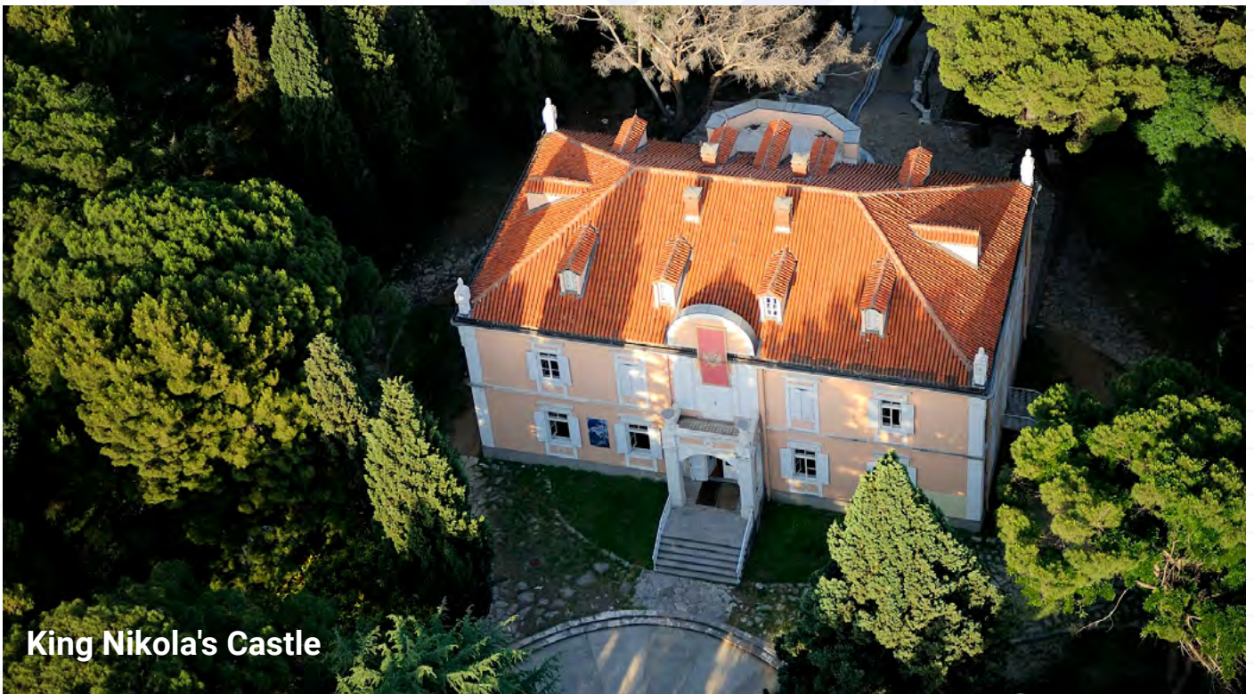
King Nikola's Castle

Podgorica's location near rivers and its historical significance make it an interesting destination for visitors, offering a blend of both ancient and modern attractions. Whether you're interested in exploring historical sites or enjoying the natural beauty of Montenegro, Podgorica has something to offer.