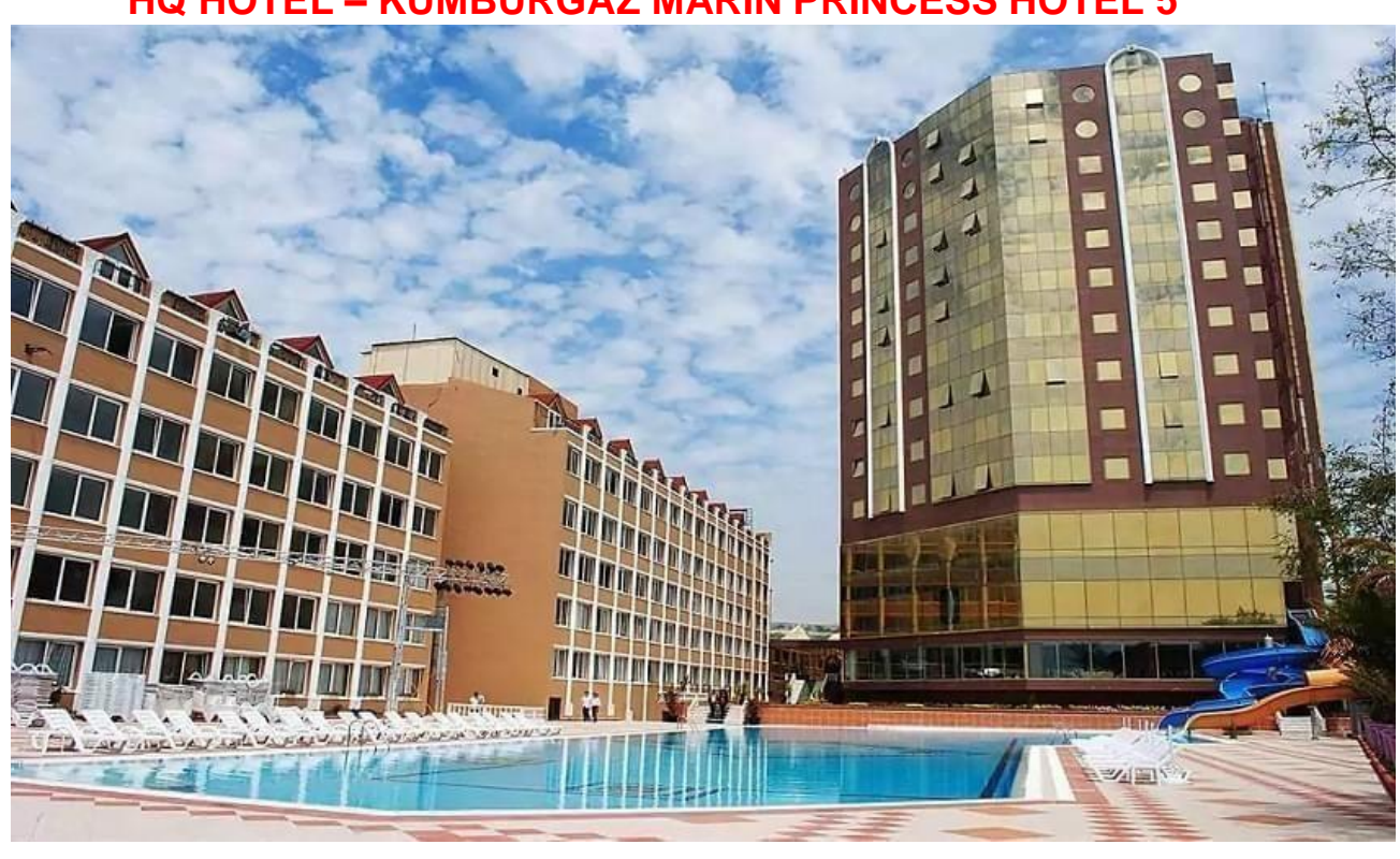
TÜYAP PALAS HOTEL 5*