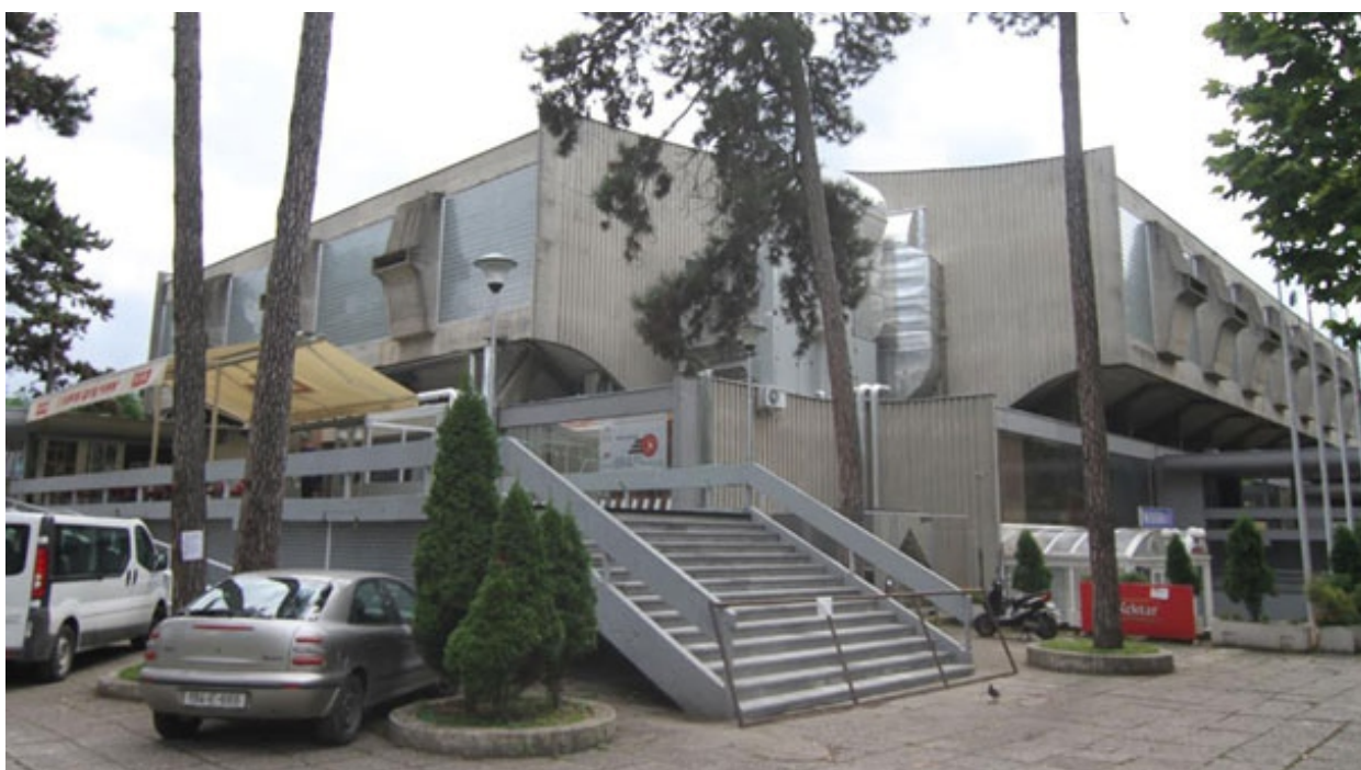
SPORT HALL „BORIK“